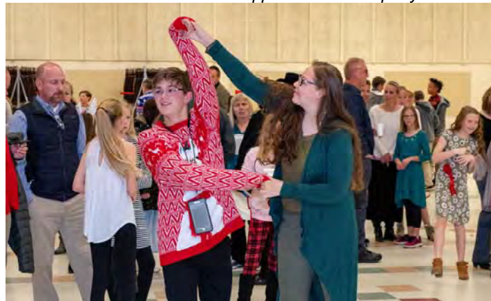
Christmas Party revelry, friendship, and line dancing!