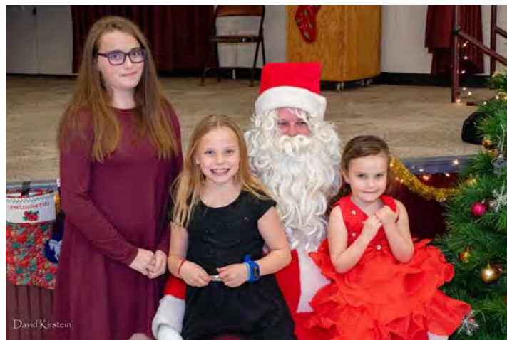
Santa Claus made an appearance at the party!