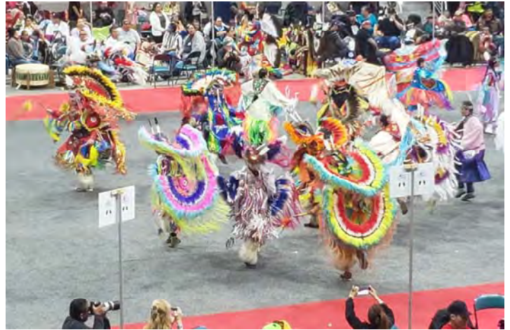
The Westernaires Interpretive Indian Dancers participating in the Inter-tribal fancy dances at the Denver March Pow Wow