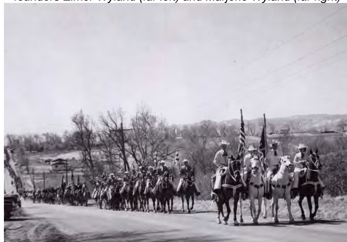
This big 1953 parade made its way down the rural roads of Lakewood. (This is Wadsworth Blvd – can you believe it?)