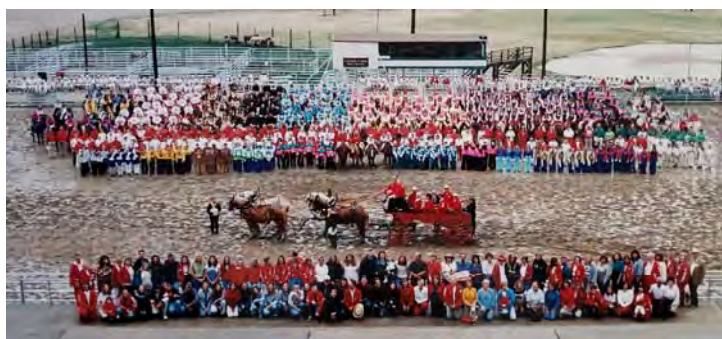
50 th Anniversary photo – 1999

We often do more than just take a photo. As we did for the 60 th , we are planning special events for the 70 th . Details are still ongoing, but you can plan on getting together with everyone this summer for a big celebration.