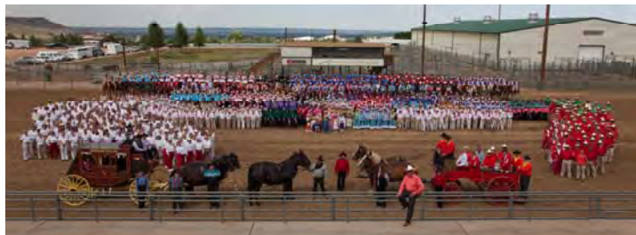
60 th Anniversary photo – 2009

Westernaires is an organization full of traditions. One big one is the ten-year tradition. Every ten years the organization gathers to celebrate another ten years of existence. During these celebrations the entire organization gathers for a 'family portrait'. Below you can see a couple of the previous portraits. If you would like to see the actual photos, just make a quick stop in our museum and go to the Westernaires Hall of Fame room.