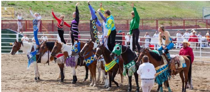
The White Division trick riders salute the crowd at the conclusion of their daring performances