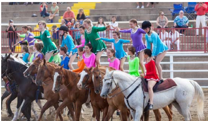
The White Vaulting team shows off their perfect balance

To submit content, photos, or ideas for an upcoming Boots & Saddles, send us an email: Boots@westernaires.org