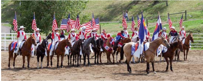
The White Division Grand Entry Team assembles after serpentine at the 2018 White Division Show

We were all there: friends, family, teammates and alumni to cheer for "the kids". And they did not disappoint. They had a great show and they all demonstrated how they RIDE WITH PRIDE!